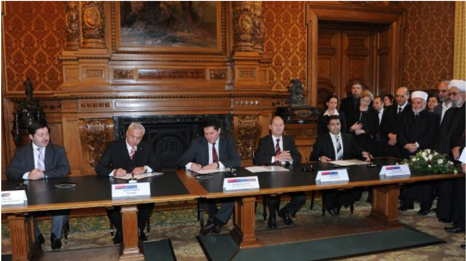
Mayor Scholz (2nd from the right) and religious representatives: "Historic day for Hamburg and Germany", Spiegel, 2012